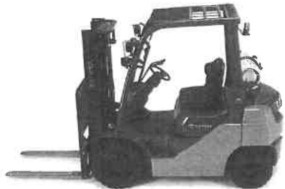
Photo may portray optional equipment not included in your quotation.

Mast 3-Stage (FSV) mast with full free lift. Mast specifications: Maximum Fork Height - 189" Overall Lowered Height - 84.5" (Overhead Guard Height - 84.10") Free Lift - 36.4" with standard Load Backrest